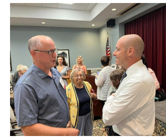
Fall Networking Social Thursday, October 19, 3:00 – 5:00 p.m. Maple Knoll Village